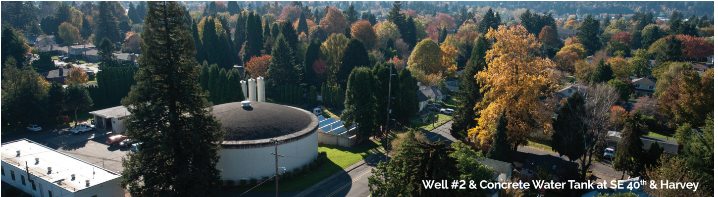
Well #2 & Concrete Water Tank at SE 40 th & Harvey