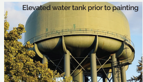
Elevated water tank prior to painting

The tank painting project took longer than expected for a couple reasons. First, weather was a major factor as the interior coating removal and recoating must be done within a limited range of moisture and temperature. Second, vandalism of contractor equipment and tool theft, which included an unauthorized shut down of generators that provided the power to keep the structure warm enough to blast and paint. Last, work hours were limited due to noise. The loudest noise was from the vacuum equipment used to remove more than 500 tons (equivalent to 1,000,000 lbs.) of sandblast media. City staff are happy to report that this type of work should only happen about every 25 to 30 years. A special thank you to the nearby neighbors for their patience during construction!