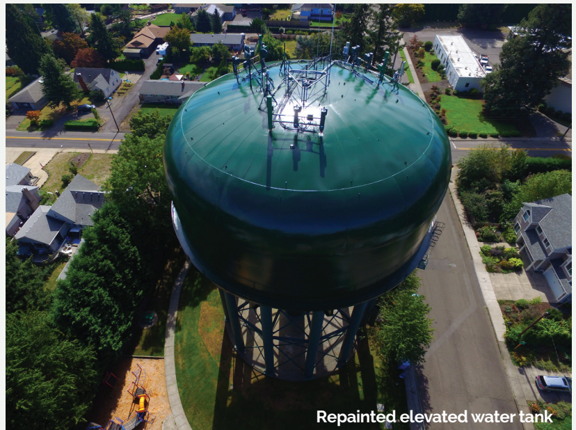
Repainted elevated water tank

The elevated water tank at SE 40th Ave. and Harvey St. is a 1.5-million-gallon reservoir that was erected in 1963 and constructed to meet the design standards of that time. Since then, knowledge about earthquakes and how it relates to the construction of infrastructure has significantly improved. Beginning in 2004, the elevated reservoir was evaluated based on new seismic building standards for essential structures. Upgrades were needed to help ensure the elevated tank could withstand a major earthquake. Once the engineering was completed and a contractor selected, the reconstruction began. The project required several months to complete at a cost of more than $345,000.