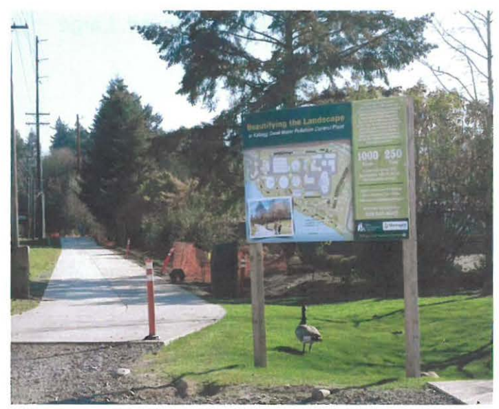
View along McLoughlin/new drip irrigation