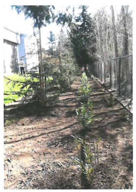
Conifers and shrubs along the fence will grow to screen views of the plant from passersby