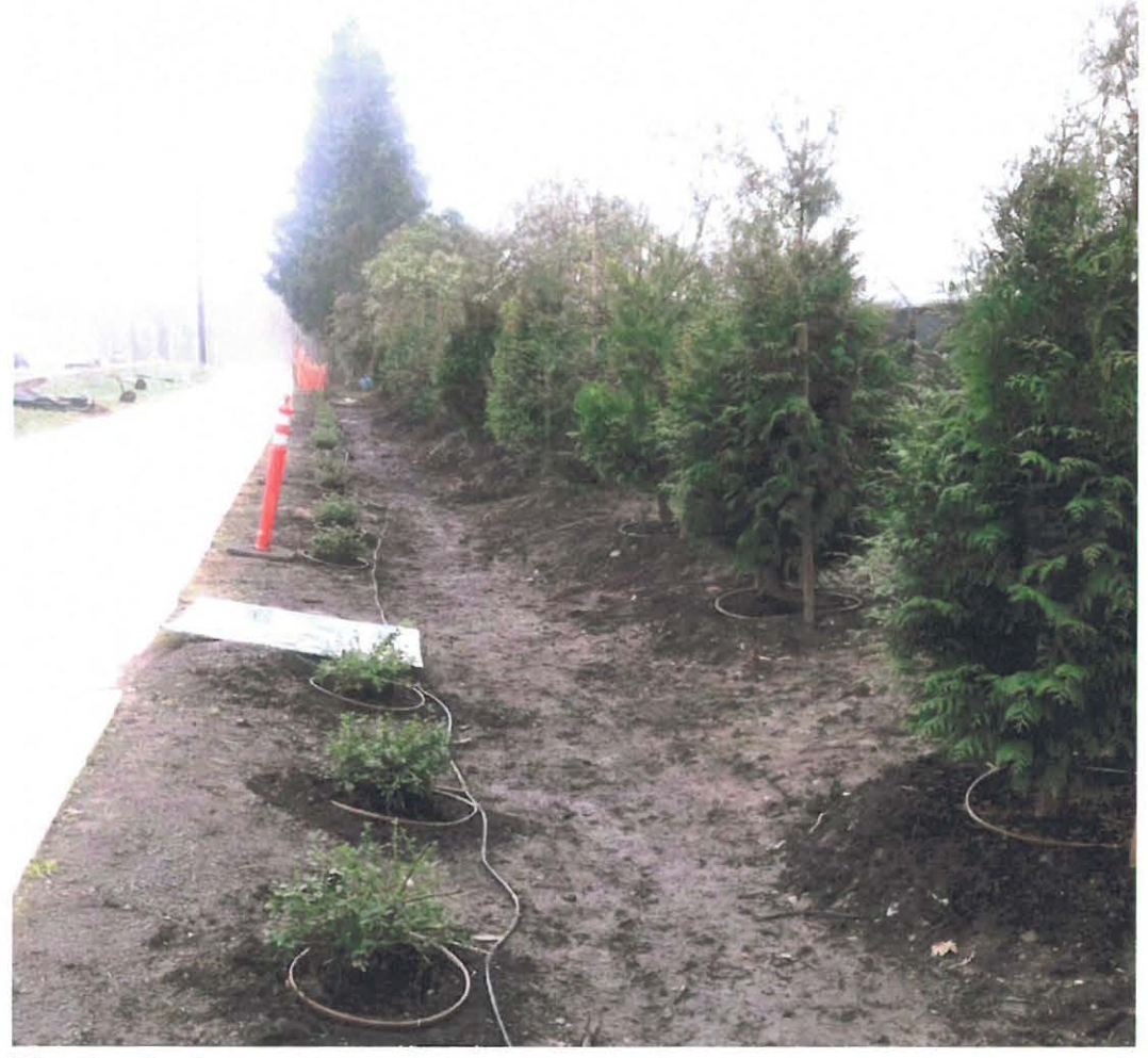
Planting beds awaiting mulch