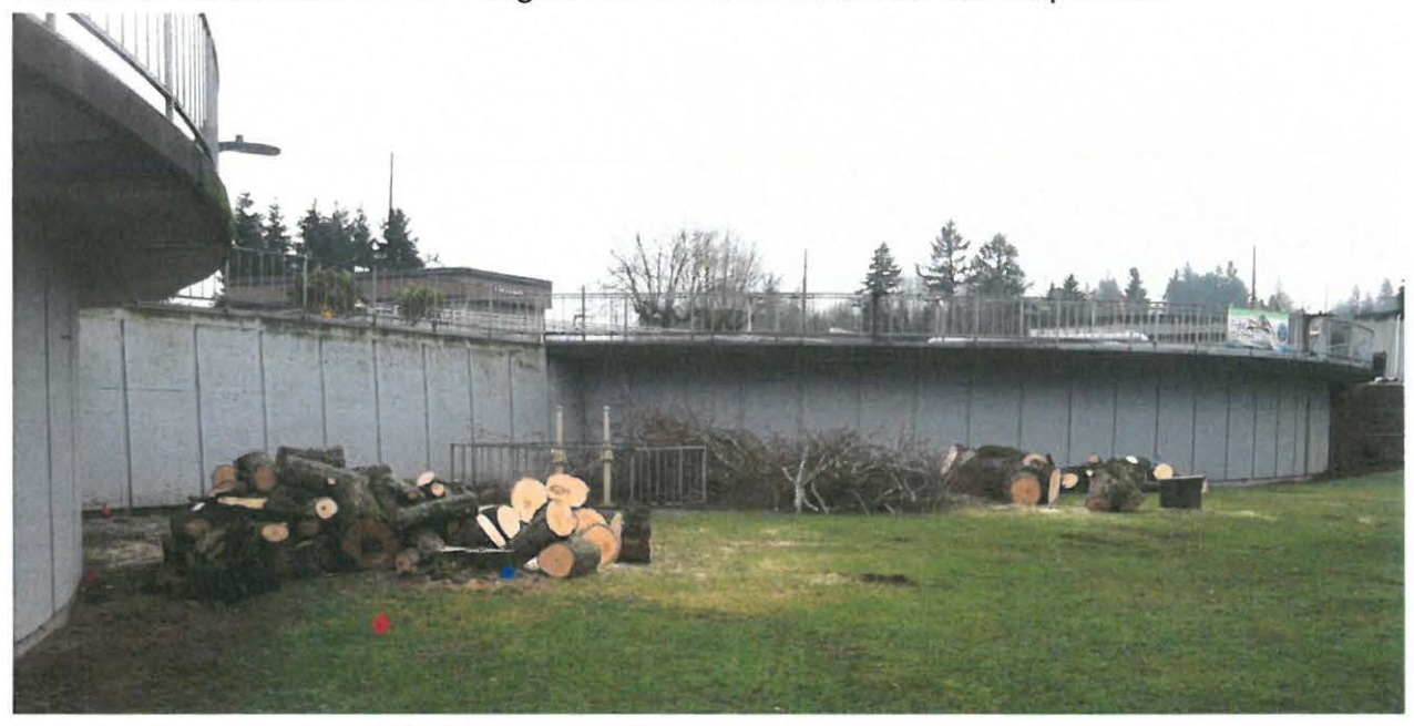
Invasive tree species slated for removal

Trees overhanging clarifiers caused maintenance issues and were removed. Large chunks of wood went to the Oregon Zoo as enrichment for the elephants!