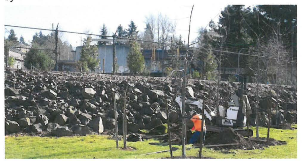
New Oregon ash trees in southwest portion of property sited to maintain existing views