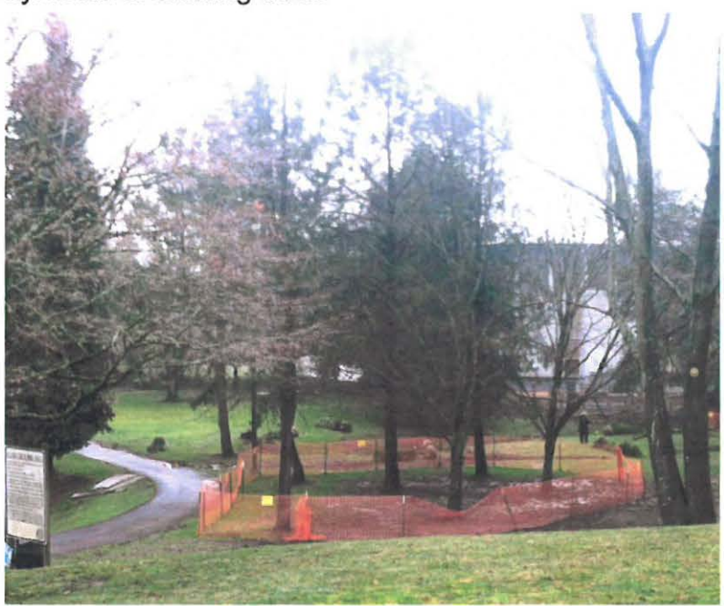
Straw wattles for erosion control

Tree protection fencing indicates where heavy equipment must keep out to protect root systems of existing trees