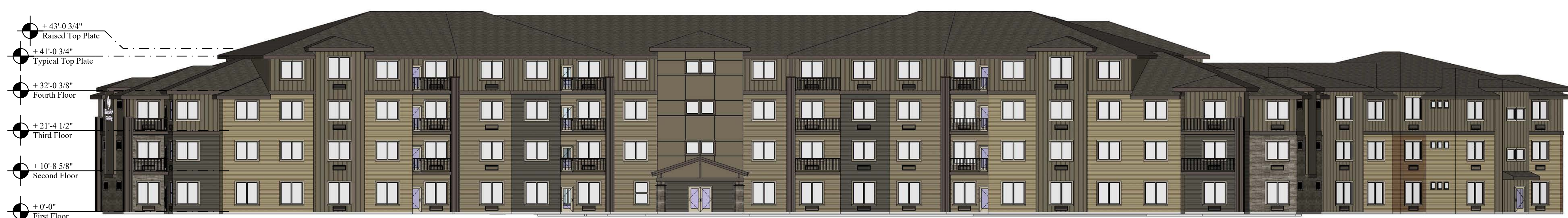
3 NORTH ELEVATION SCALE: NTS