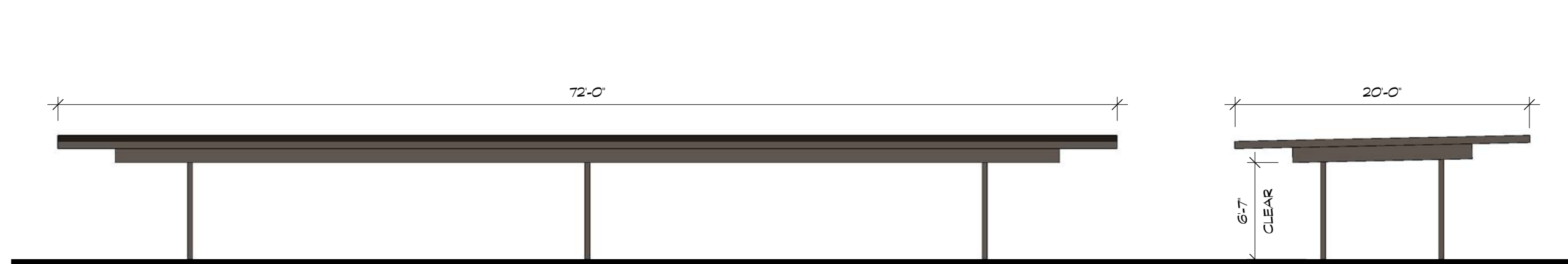
6 Typical Carport SCALE: 1/8" = 1'-0"