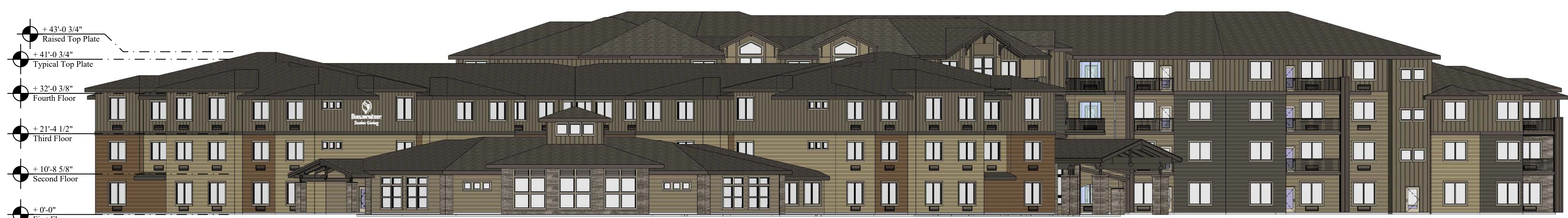
4 SOUTH ELEVATION SCALE: NTS