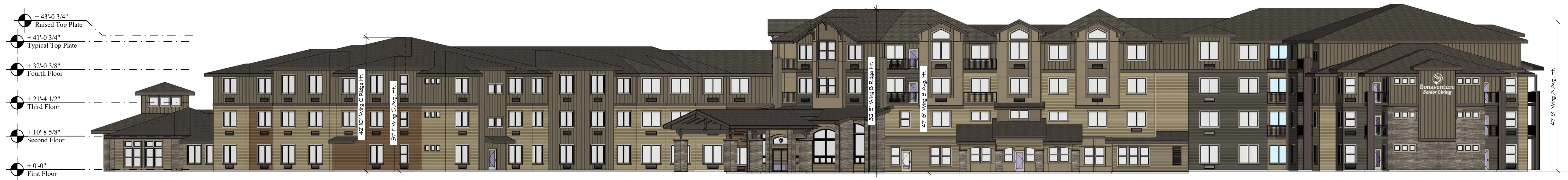
1 EAST ELEVATION SCALE: 1/16" = 1'-0"