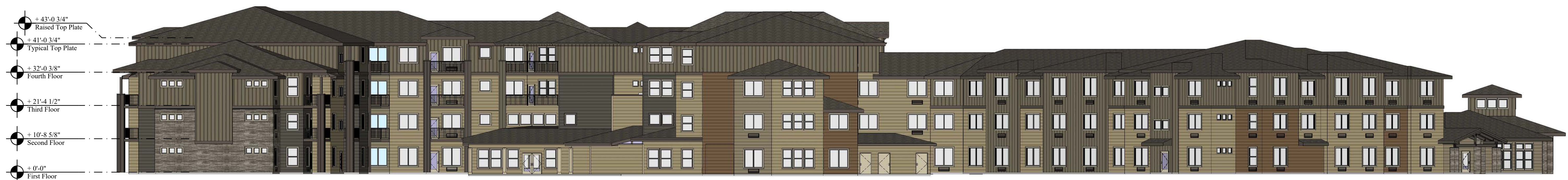
2 WEST ELEVATION SCALE: NTS