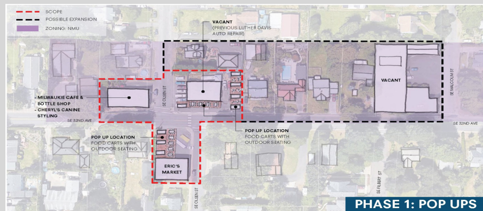
PHASE 1: POP UPS

Phase 1 shows the short-term redevelopment of a hub through pop-up locations.