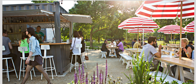
Hub Example: Small Cafe with Outdoor Seating