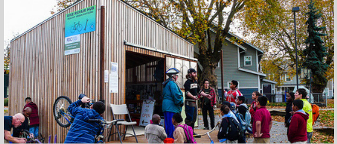
Hub Example: Community Bicycle Repair Shed

Learn more about NDAs at: www.milwaukieoregon.gov