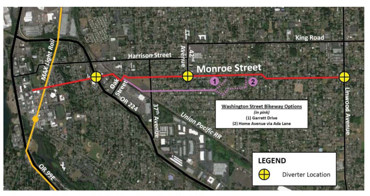
Red line is Monroe only alignment; pink line shows possible options for the Monroe-Washington route

As part of the effort to determine what improvements will make Monroe Street a safer route for bicycles, pedestrians, and vehicles between downtown Milwaukie and the city boundary at Linwood Avenue, a proposal has been made to direct bicycles onto Washington Street at 37<sup>th</sup> Avenue, following either Garrett Drive or Home Avenue (via Ada Lane) back to the primary route on Monroe Street. (See illustration below, where the Washington Street bikeway is shown in pink.)