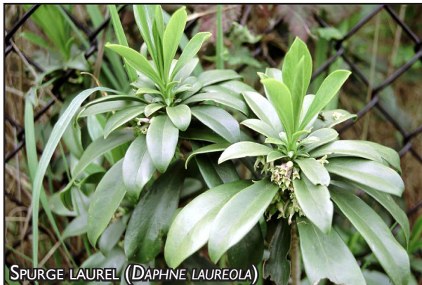
SPURGE LAUREL ( DAPHNE LAUREOLA )