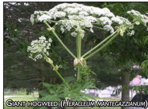
GIANT HOGWEED ( HERACLEUM MANTEGAZZIANUM )