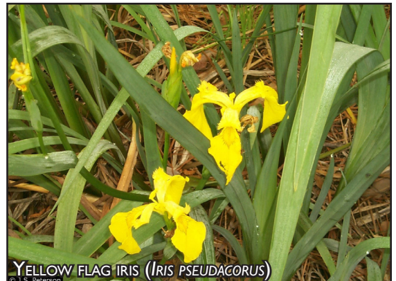
YELLOW FLAG IRIS ( IRIS PSEUDACORUS )