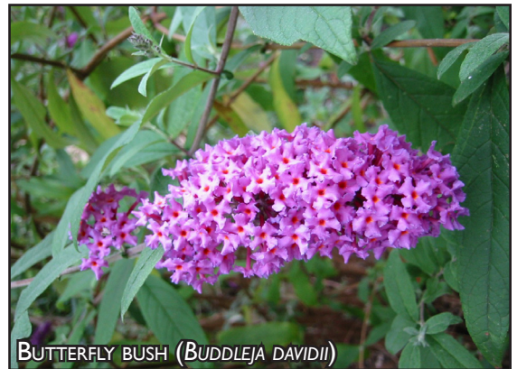
BUTTERFLY BUSH ( BUDDLEJA DAVIDII )