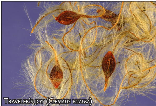
TRAVELER'S JOY ( CLEMATIS VITALBA )

There are many nuisance plants identified as part of the Milwaukie Native Plant List. The following photos are of species that are either most common in Milwaukie or that present the greatest threat to our native plant communities. For a more complete list of nuisance plants, see the Milwaukie Native Plant List, which is available online at http://www.milwaukieoregon.gov/planning/natural-resources-milwaukie-native-plant-list . For other pictures of these plants, visit the U.S. Department of Agriculture (USDA) website and check out the Image Gallery of plants: http://plants.usda.gov/gallery.html .