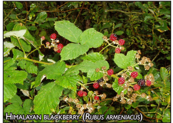
HIMALAYAN BLACKBERRY ( RUBUS ARMENIACUS )