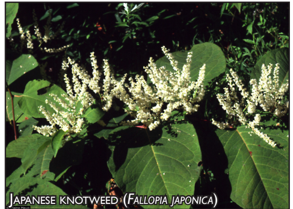
JAPANESE KNOTWEED ( FALLOPIA JAPONICA )