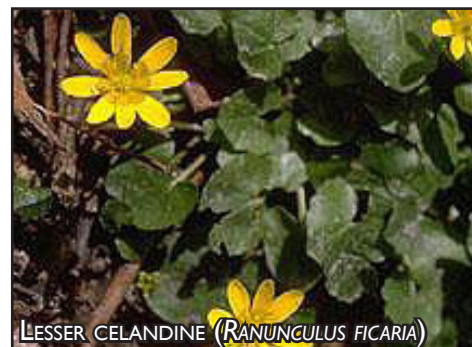
LESSER CELANDINE ( RANUNCULUS FICARIA )

Other Common Nuisance Plants: 1. Yellow archangel ( Lamium galeobdolon ); 2. Hedge bindweed/Morning glory ( Calystegia sepium ); 3. Tansy ragwort ( Senecio jacobaea ); 4. Policeman's helmet ( Impatiens glandulifera ); 5. Reed canarygrass ( Phalaris arundinacea ); 6. Holly ( Ilex ); 7. Orange hawkweed ( Hieracium aurantiacum ); 8. False brome ( Brachypodium sylvaticum ); 9. Pokeweed ( Phytolacca americana ); 10. Tree of heaven ( Ailanthus altissima ); 11. Canada thistle ( Cirsium arvense )