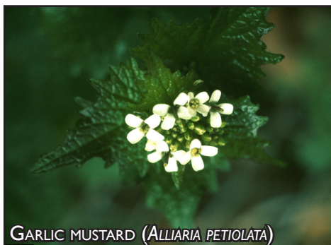
GARLIC MUSTARD ( ALLIARIA PETIOLATA )