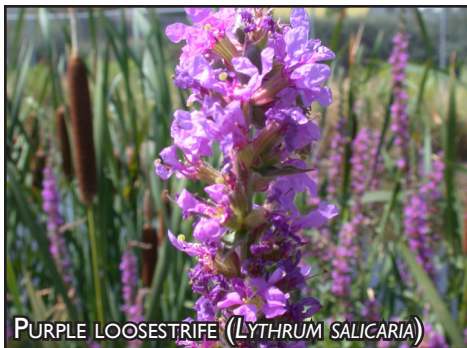
PURPLE LOOSESTRIFE ( LYTHRUM SALICARIA )