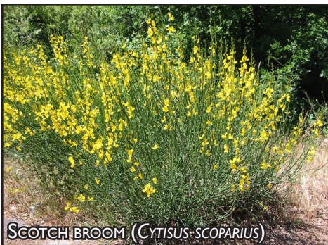
SCOTCH BROOM ( CYTISUS SCOPARIUS )