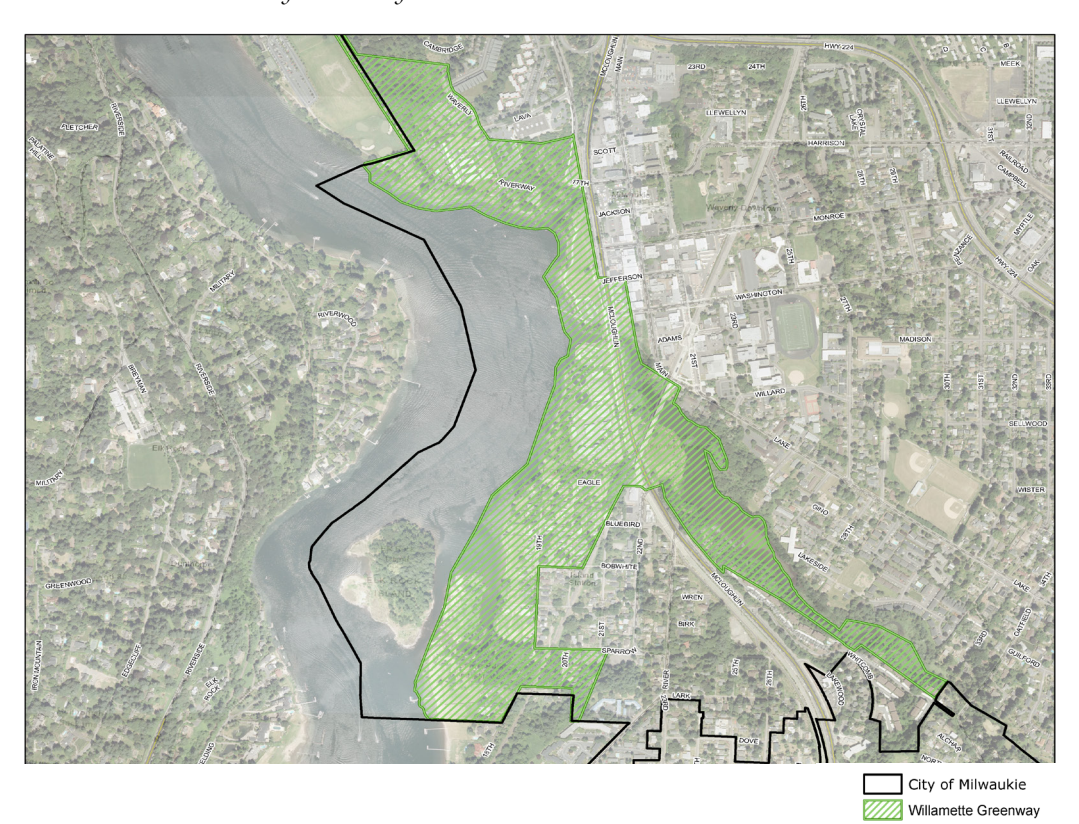
Figure 1. Willamette Greenway Boundary