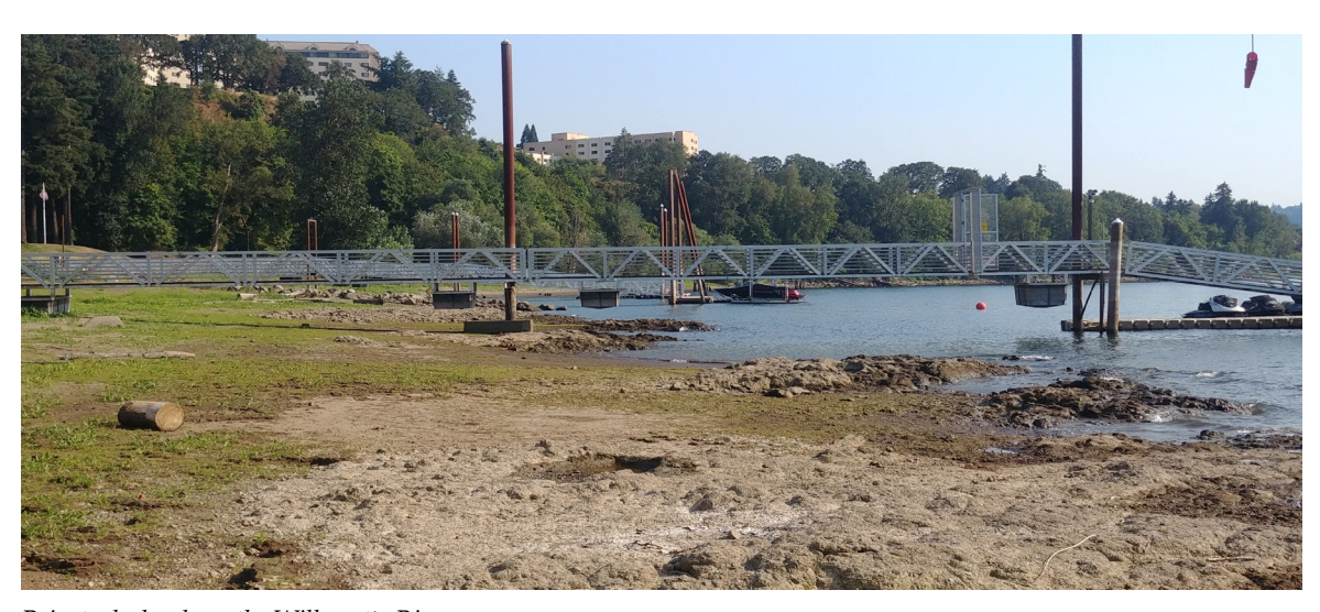
Private docks along the Willamette River

It should also be noted that Goal 15: Willamette River Greenway overrides Goal 5: Natural Resources, Scenic and Historic Areas, and Open Spaces. Milwaukie implements Goal 5 through its Natural Resources (NR) Overlay Zone and the accompanying discretionary review process (as discussed further in the Natural Resources Background Report). Therefore, unless a natural resources review standards and evaluation criteria are added to the Greenway Review process, the City should specifically state in its policies that it will use the Goal 5 process to review and manage natural resource review within the Greenway.