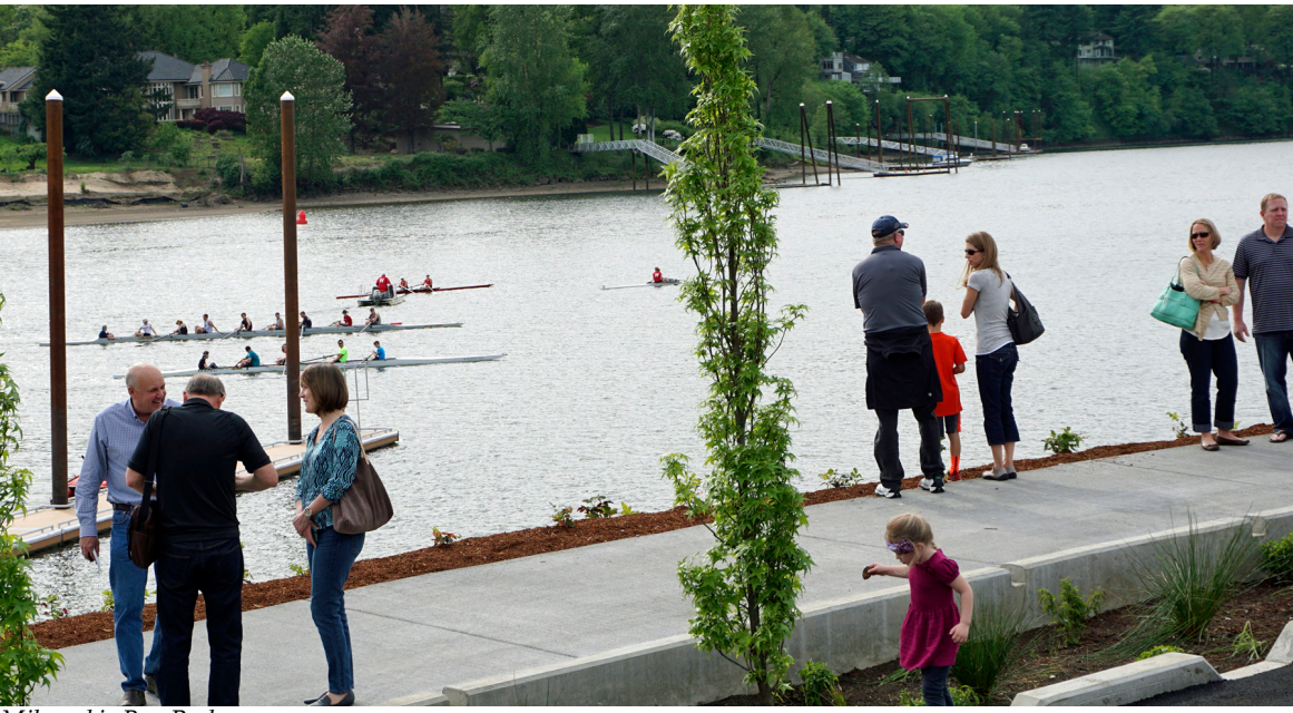
Milwaukie Bay Park

Milwaukie adopted the Downtown and Riverfront Land Use Framework Plan in 2000 and updated it in 2015. The plan is an ancillary document to the Comprehensive Plan, and can provide some guidance for potential Greenway-related policy amendments in the Comprehensive Plan. A fundamental concept of the Framework Plan is connecting downtown Milwaukie to the riverfront, and the plan calls for enhancements to the Milwaukie Bay Park and safe pedestrian and bicycle crossings between downtown and the park.