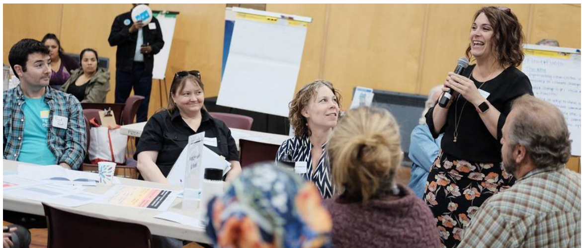
Figure 2: Climate Action Plan Summit, Picture by Hamid Shibata Bennett