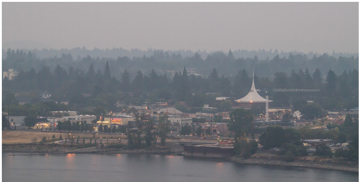
Figure 3: Downtown Milwaukie Covered in Wildfire Smoke, Summer 2018