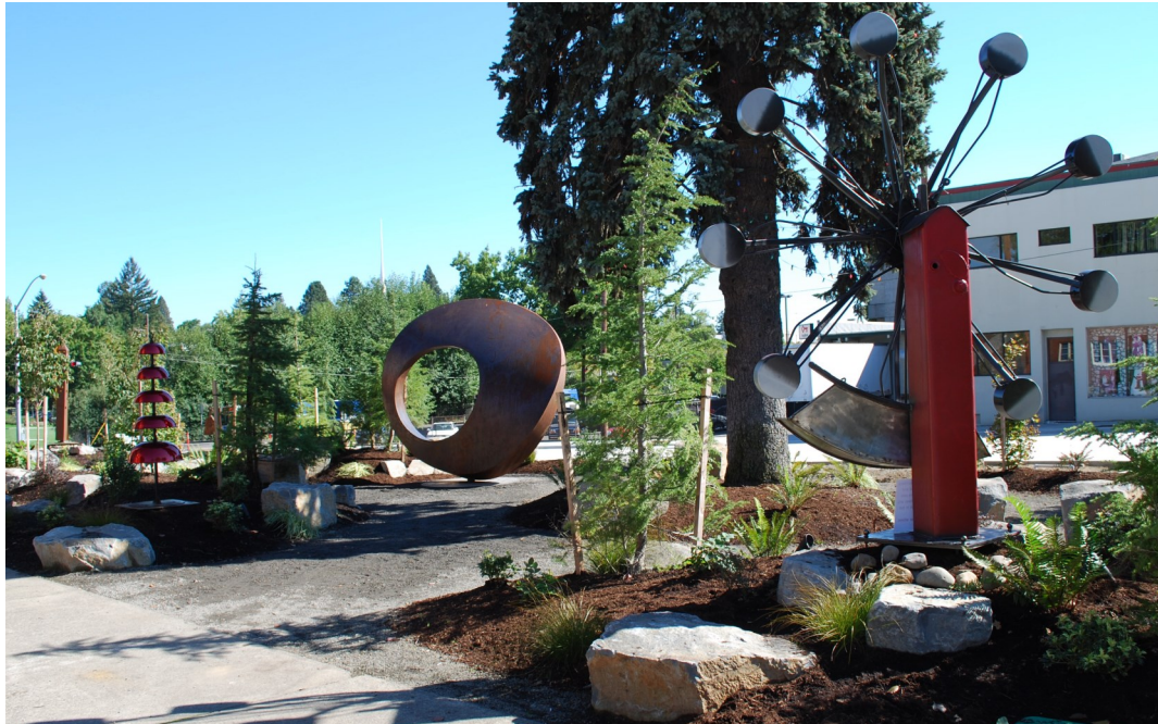
Sculpture Garden at Milwaukie City Hall

performance for the public should be done in a thoughtful and logical manner so that the benefits of these works reach the most number of people, with an emphasis on communities and populations who have been traditionally underserved.