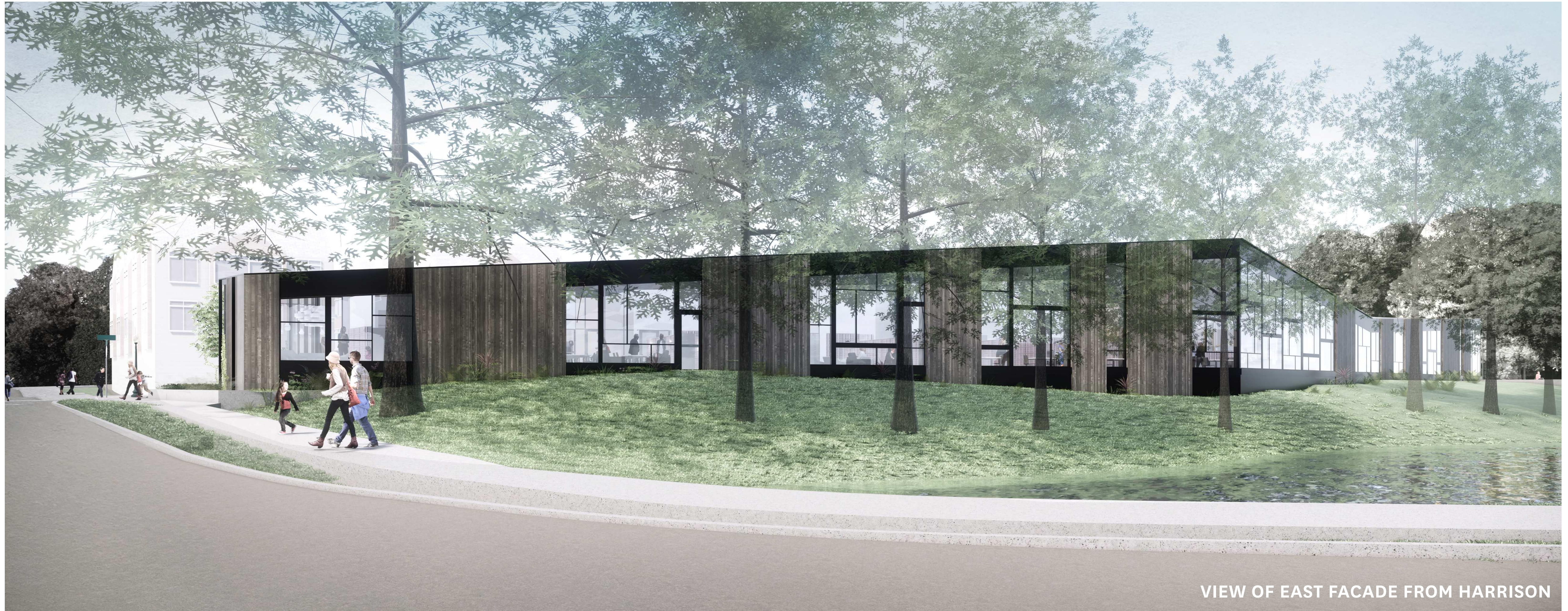
VIEW OF EAST FACADE FROM HARRISON