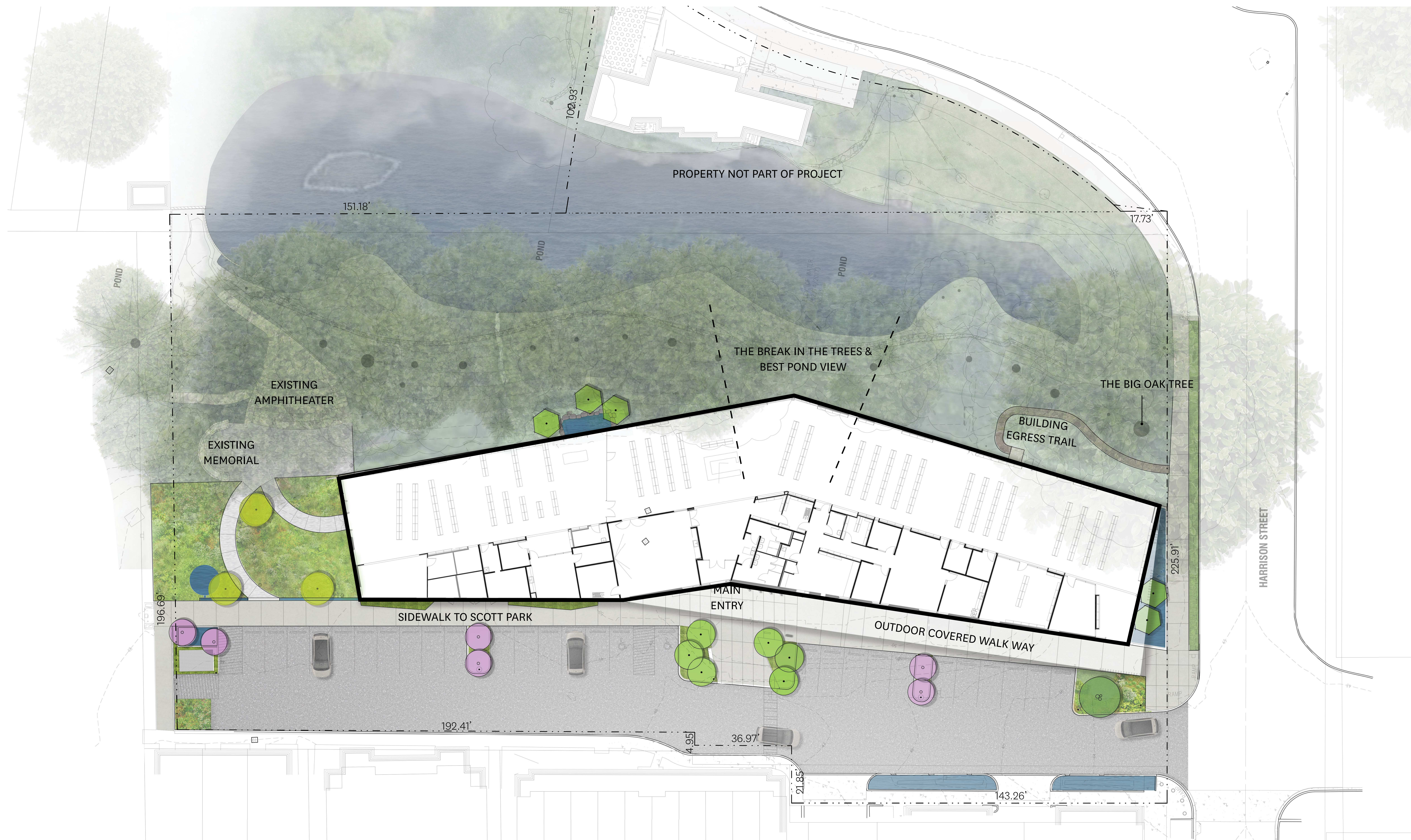
LANDSCAPE SITE PLAN