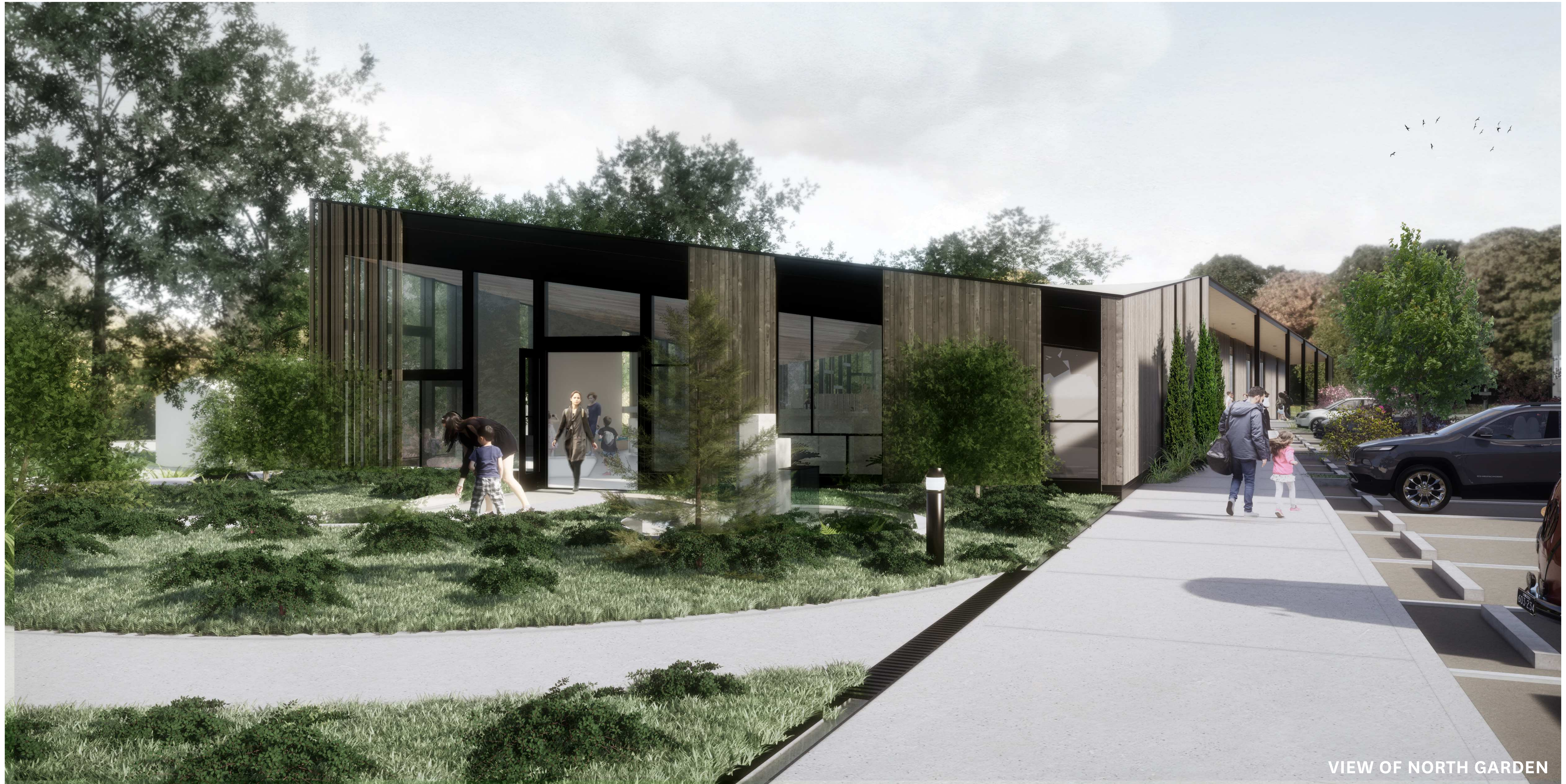
VIEW OF NORTH GARDEN