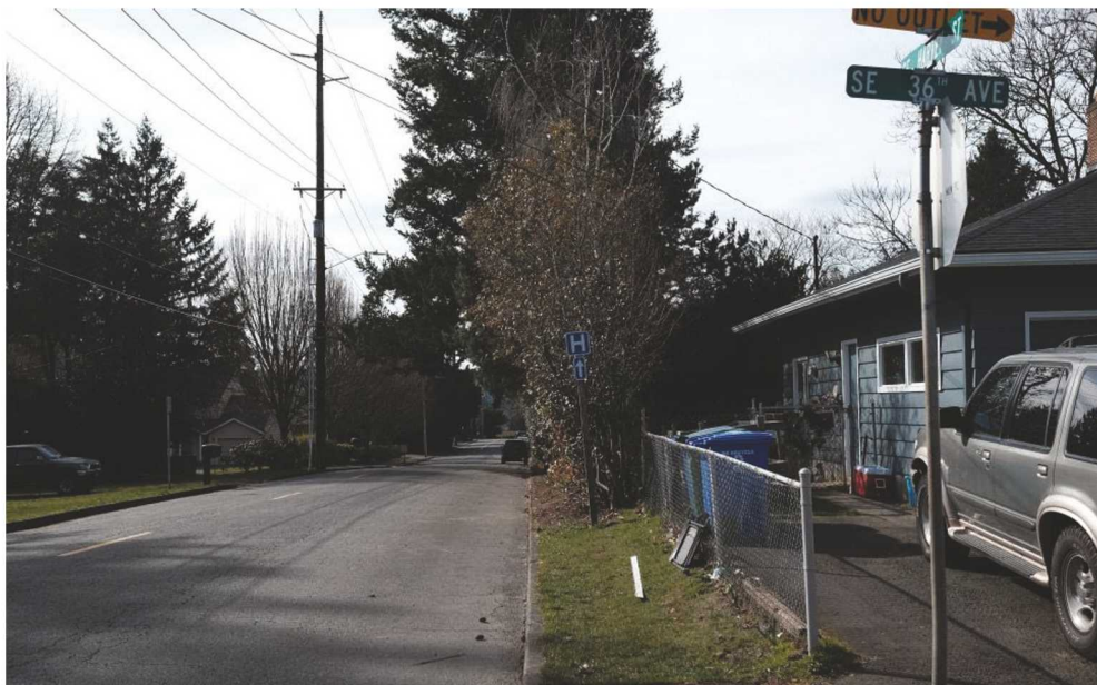
Current view of Harvey Street at 36th Avenue