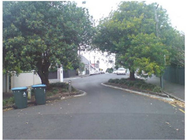
Chicanes (short sections of narrower road used to install stormwater treatment or preserve individual large trees)