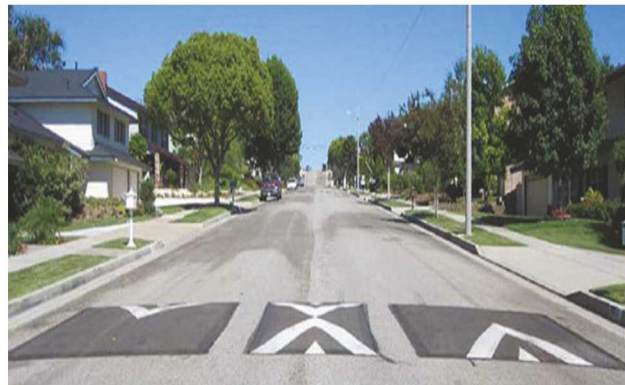
Speed cushions (speed bumps in the road, with wheel cutouts that emergency vehicles can use)

Do you have any questions or comments about traffic calming measures?