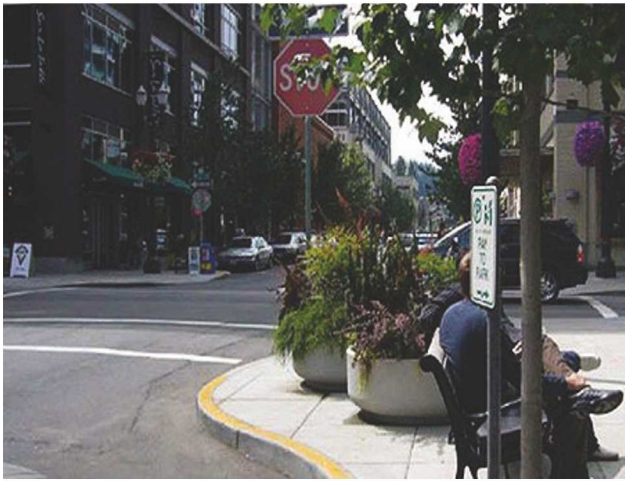
Bulb-outs or corner extensions (narrower road at intersections with shorter crosswalk distance and wider sidewalk)