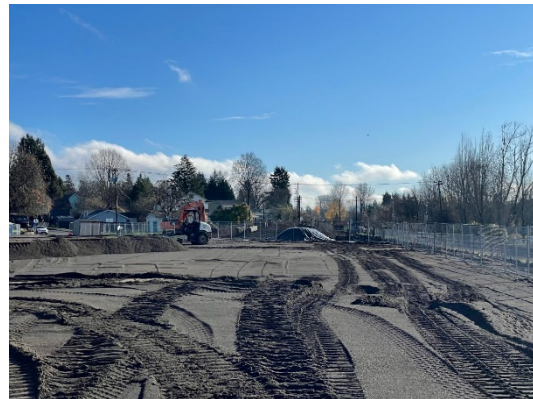
12/14/21 Parcel 2 looking east, showing clubhouse pad to left. Fenced-off uncapped area with mound and excavated stockpiled soil in background.