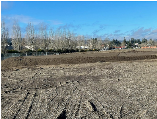
12/14/21 Parcel 2 fill in Clubhouse area, looking west. Parcel 2 orange fencepost in distance.