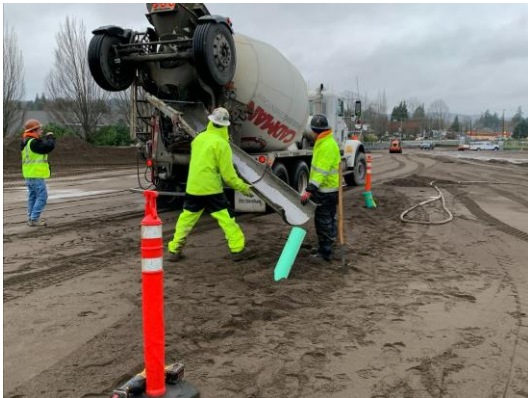
12/6/21 Parcel 1 abandoned sewer line backfill.