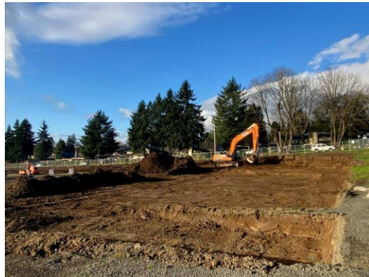
12/8/21 Parcel 1 NE corner cut.