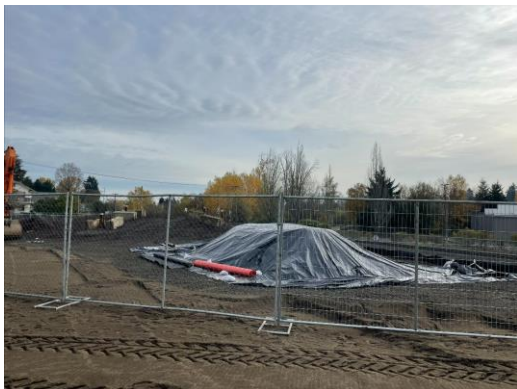
11/24/21 View to south from center of Parcel 2, showing fence separating stockpile and Mound area from temporary capped area.