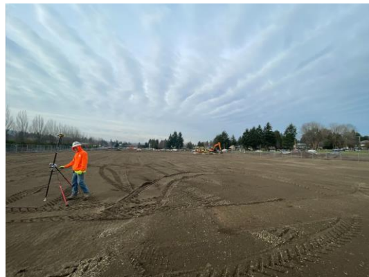
11/24/21 Westward view of Parcel 2. Clean fill temporary cap above fabric/geotextile.