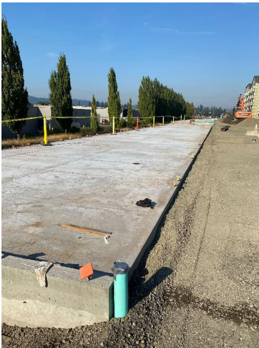
10/14/22 Parcel 2 Garage 2 set slab-on-grade concrete (poured last week), viewing northwest.