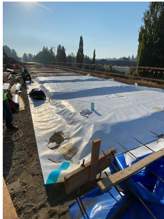
10/14/22 Parcel 2 Garage 2 vapor barrier installation, viewing south.