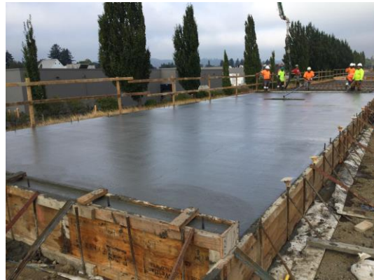
10/6/22 Parcel 2 Garage 2 slab-on-grade pour, viewing west.