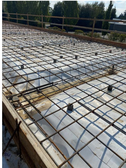
9/30/22 Parcel 2 Garage 2 build pad preparation. Rebar installed over PrePrufe vapor barrier, viewing south.