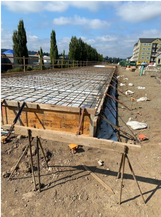
9/30/22 Parcel 2 Garage 2 build pad preparation, viewing northwest.