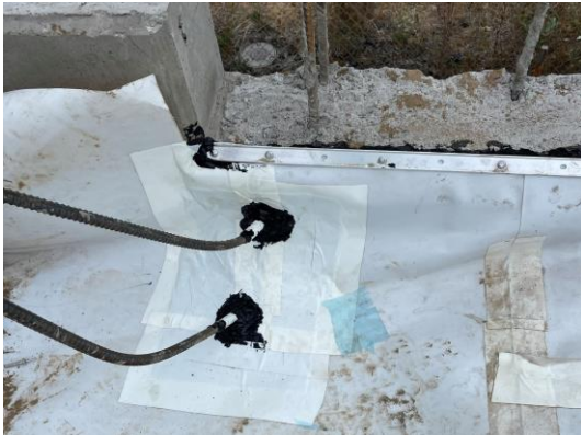
9/22/22 Parcel 2 Garage 2 PrePrufe vapor barrier membrane rebar penetration tie-in.