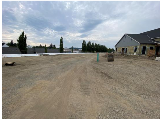
9/21/22 Parcel 2 4-inch temporary, clean backfill pavement cap over utility trench stockpile soil buried between Garage 2 footprint (left) and Clubhouse (right), viewing west.