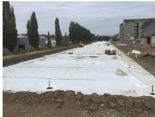
9/15/22 Parcel 2 Garage 2 PrePrufe vapor barrier membrane installation progress.