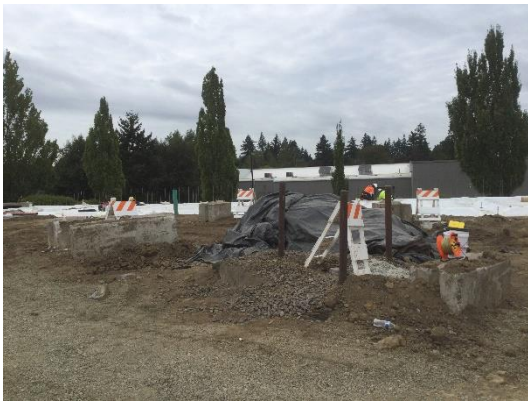
9/15/22 Adjusted Parcel 2 wells DMW-10, IMW-10, VDMW-14, and DMW-14 protected by ecology blocks and barricades.