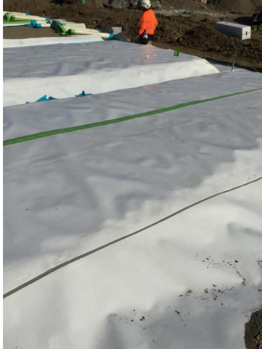
9/9/22 Start of Parcel 2 Garage 2 Vapor Barrier installation.