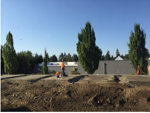
9/9/22 Parcel 2 Garage 2 subgrade preparation for vapor barrier installation.