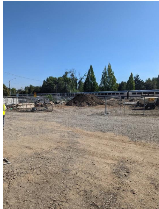
9/1/22 Excavated stockpiled utility trench soil, prior to covering with visqueen, looking south on Parcel 2 towards exclusion zone.