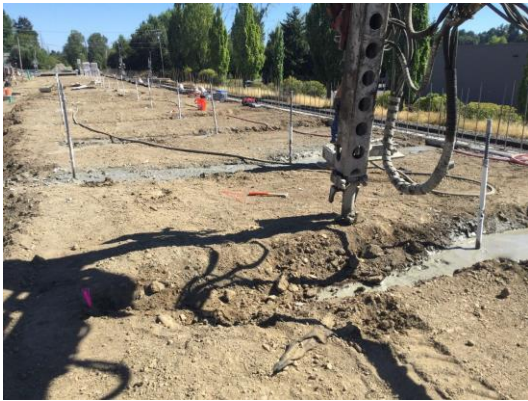
8/23/22 Installation of Garage 2 micropiles on Parcel 2, looking southeast.