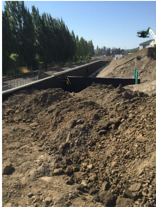
8/24/22 Backfill beneath Garage 2 area, looking west from Parcel 2 towards Parcel 1. Parcel 1/2 divide in center of photo.