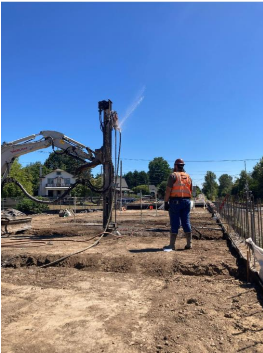
8/16/22 Installation of Garage 2 micropiles on Parcel 2, looking east.