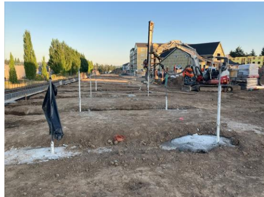
8/17/22 Micropiles in Garage 2 area, looking west. Clubhouse on right and Building 1 beyond.