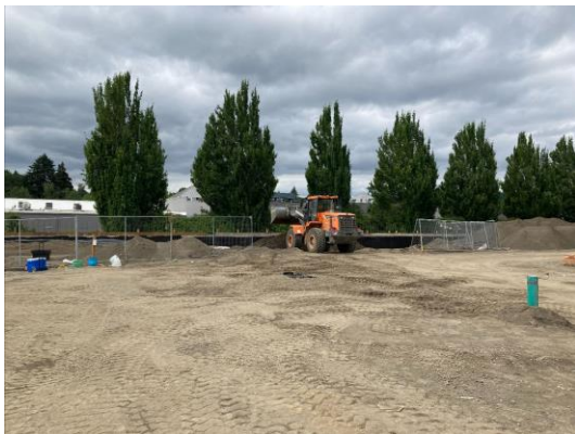
8/10/22 Backfilling Garage 2 footprint in Parcel 2, looking south.