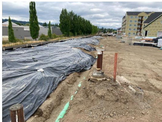
8/10/22 Garage 2 area on left, looking west, and protected monitoring wells next to storm utility line (Parcel 2). Clubhouse on right and Building 1 beyond.