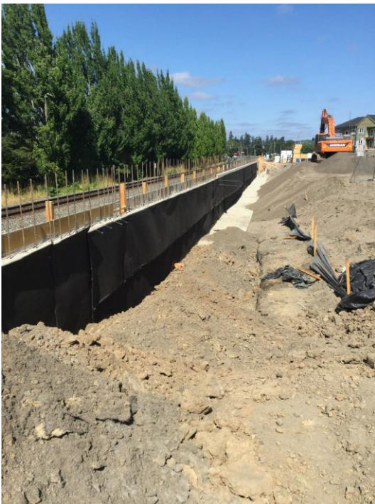
8/2/22 Garage 2 retaining wall with rebar sticking out to delineate Parcel 1 and Parcel 2 boundary, looking northwest (Parcel 2). Additional space remains for backfilling soil against retaining wall.