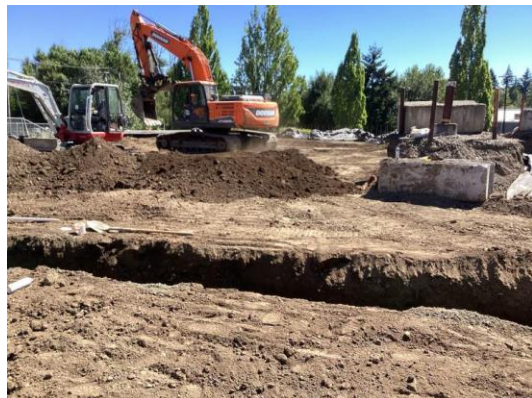
8/5/22 Preparing Garage 2 area for micropile installation. Protected monitoring wells on right.