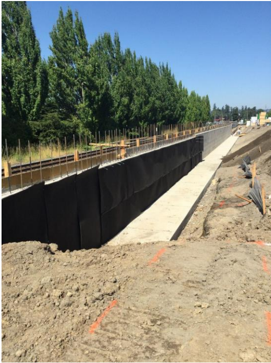
7/26/22 Garage 2 retaining wall with drain mat installed and ready for backfill, looking northwest (Parcel 2).