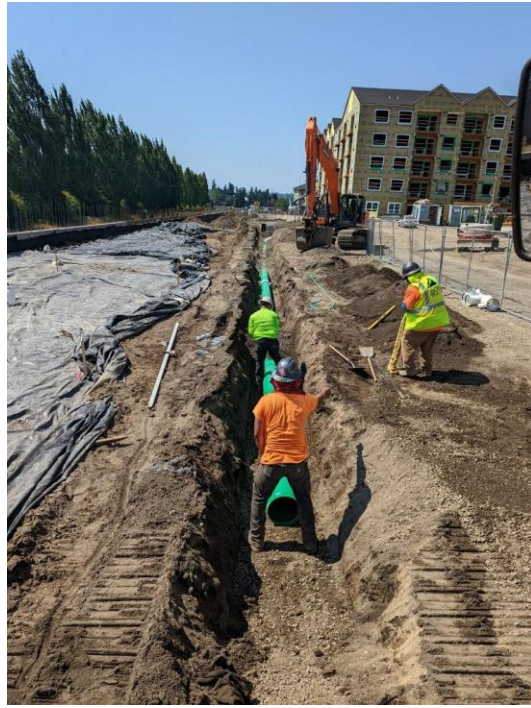
7/28/22 Storm utility trench, looking northwest (Parcel 2). Covered backfilled Garage 2 area to left.