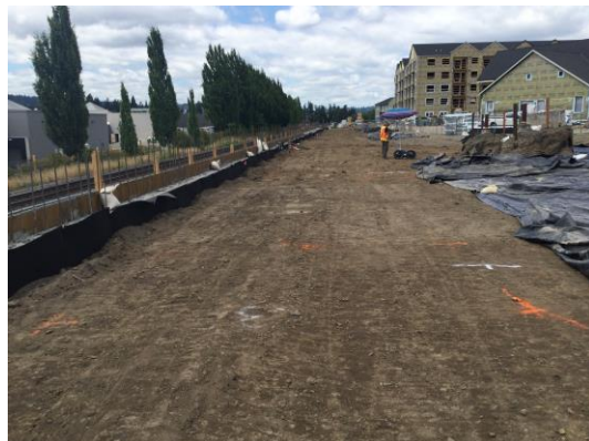
7/22/22 Garage 2 footprint with active GPR investigation for future micropiles installation, looking west (Parcel 2).