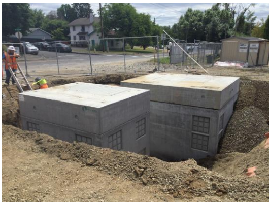
7/22/22 Excavation progress for water utilities, looking south (Parcel 2).