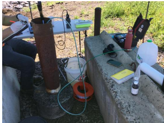
7/12/22 Semiannual groundwater sampling at mound well DMW-14, looking west (Parcel 2).