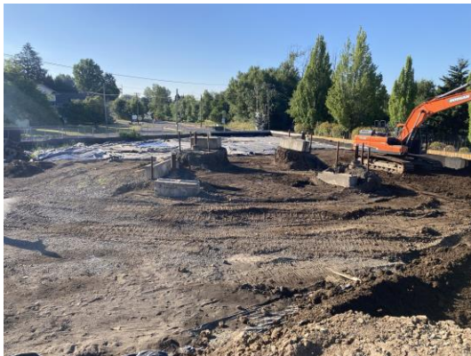
7/15/22 McFarland mound excavated and utilized in Garage 2 retaining wall backfill, looking south (Parcel 2).