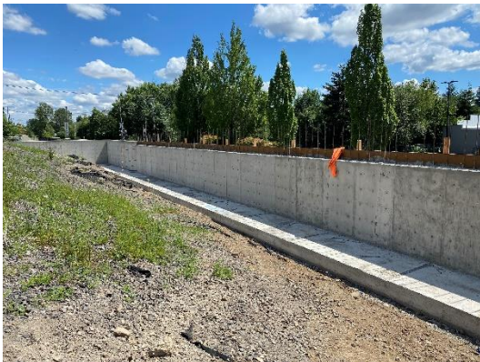
7/7/22 Garage 2 retaining wall, looking west (Parcel 2).