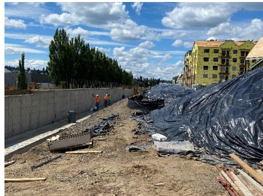
7/7/22 Garage 2 retaining wall with covered stockpiles and Building 1 in the distance, looking east (Parcel 2).