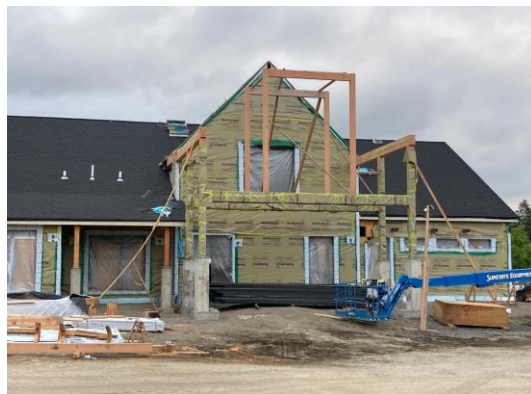
7/1/22 Parcel 2 Clubhouse construction progress.