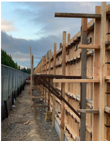
7/1/22 Garage 2 retaining wall foundation forms, looking west (Parcel 2).