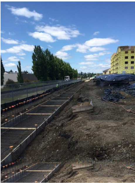
6/20/22 Garage 2 retaining wall foundation forms, from east end of Garage 2, looking west (Parcel 2).