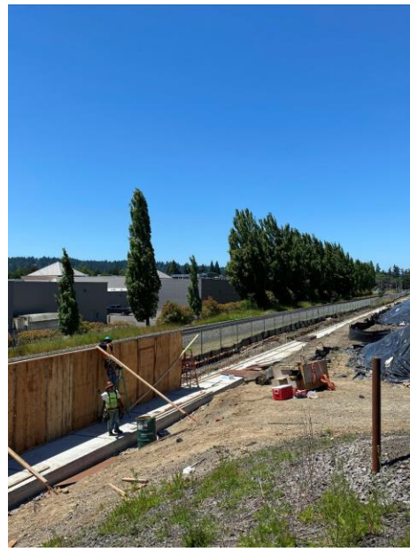
6/23/22 Parcel 2 view from McFarland Mound, looking southwest toward Garage 2 retaining wall forms.