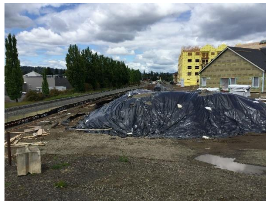
6/14/22 Parcel 2 view from McFarland Mound, looking west toward stockpiles. Garage 2 retaining wall foundation excavation to left. Clubhouse to right, with Building 1 in background.