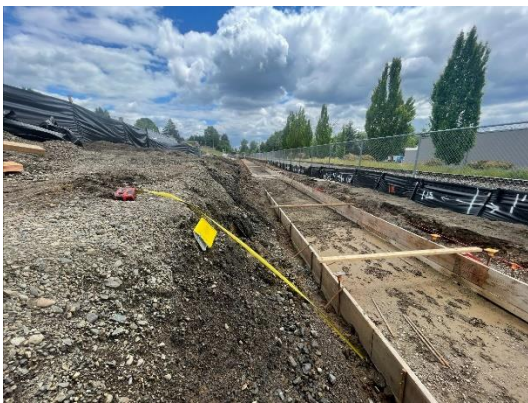
6/14/22 Garage 2 retaining wall foundation forms, from west end of Garage 2, looking east (Parcel 2).