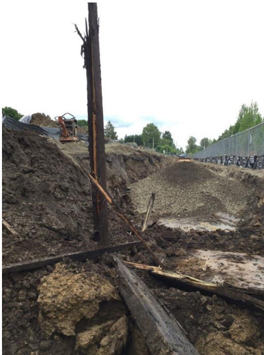
6/6/22 Dark-stained wood debris removed from Garage 2 retaining wall foundation excavation, looking east along southern property line (Parcel 2).