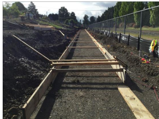
6/6/22 Garage 2 retaining wall foundation forms in eastern half of backfilled excavation, looking east.