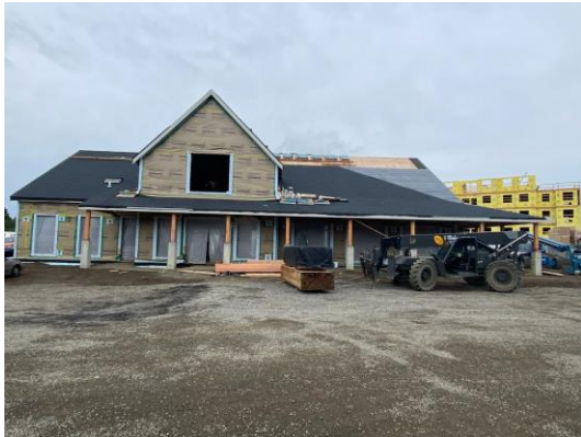
5/27/22 Clubhouse (Parcel 2), looking west.