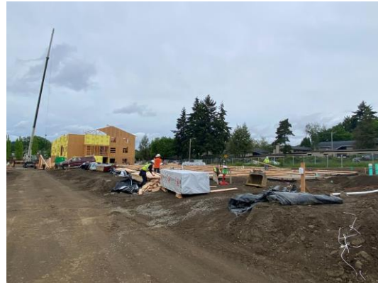
5/27/22 Building 2 in background and Building 3 in foreground (Parcel 1), looking northwest.