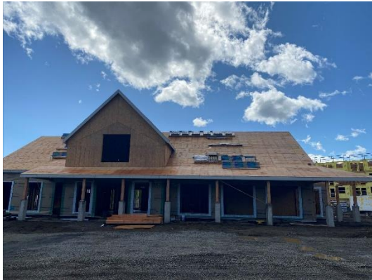
5/19/22 Clubhouse (Parcel 2), looking west.