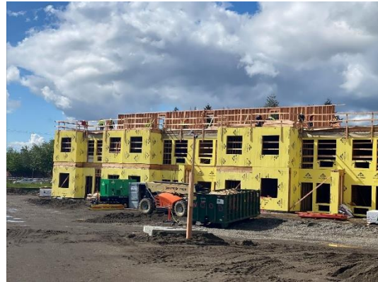
5/19/22 Building 2 (Parcel 1), looking northwest.