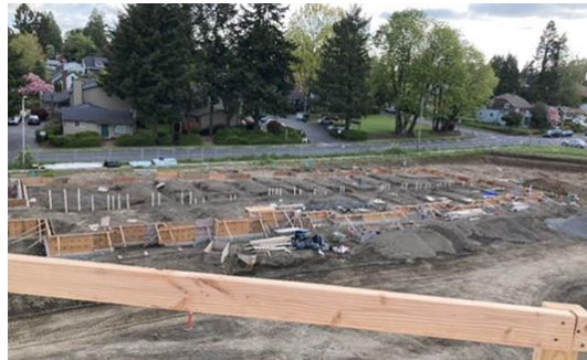
5/13/22 Building 4 (Parcel 1), looking northeast.