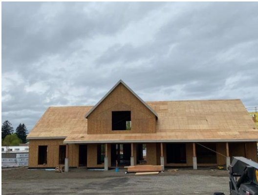
5/13/22 Clubhouse (Parcel 2), looking west.