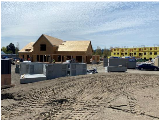
5/5/22 Clubhouse (Parcel 2), looking west.