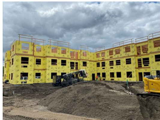
5/5/22 Building 1 (Parcel 1), looking south.