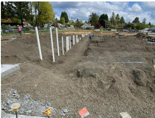
4/29/22 Building 4 (Parcel 1), looking east.