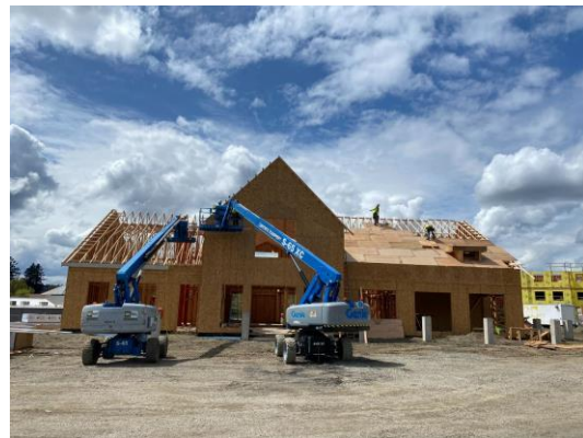
4/29/22 Clubhouse (Parcel 2), looking west