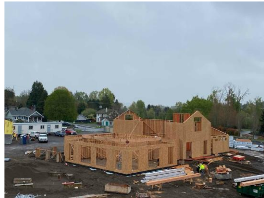
4/20/22 Clubhouse (Parcel 2), looking southeast.