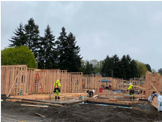
4/20/22 Building 2 (Parcel 1), looking east.