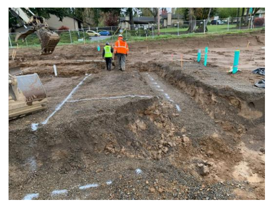
4/12/22 Building 4 footings, looking north.