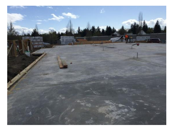
4/5/22 Clubhouse after slab pour, looking south-southwest.