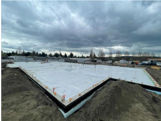
3/28/22 Clubhouse vapor barrier, looking southwest.