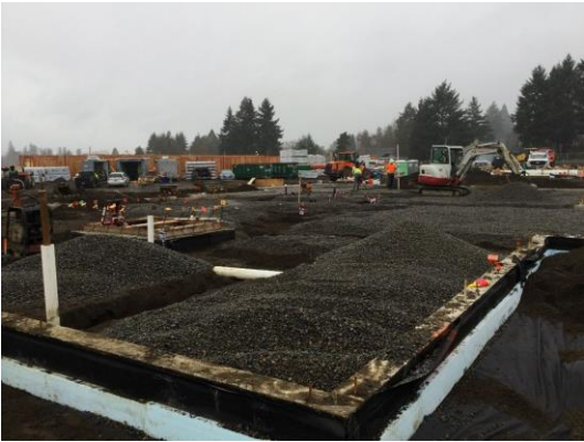
3/23/22 Clubhouse interior footings, looking north. Elevator pit in center left.