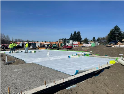
3/24/22 PrePrufe275 vapor barrier installation in Clubhouse area, looking north.