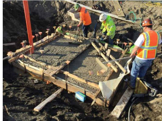
3/7/22 Clubhouse elevator pit bottom after concrete pour.