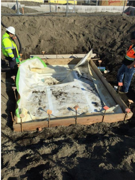
3/7/22 Clubhouse elevator pit vapor barrier.