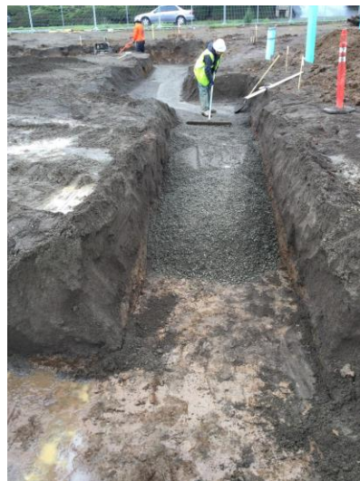
3/1/22 Parcel 1 Building 3 footing excavations, looking northeast.