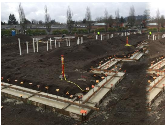
3/1/22 Parcel 1 Building 2 perimeter footings looking northwest.