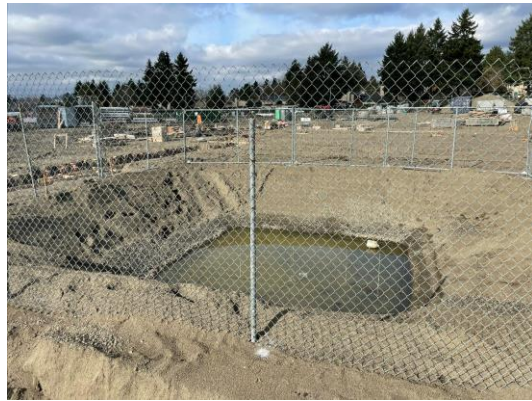
2/17/22 Clubhouse elevator pit on Parcel 2.