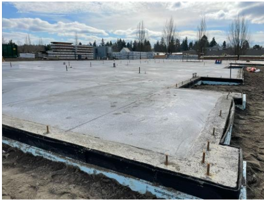
2/17/22 Building 1 slab on Parcel 1.