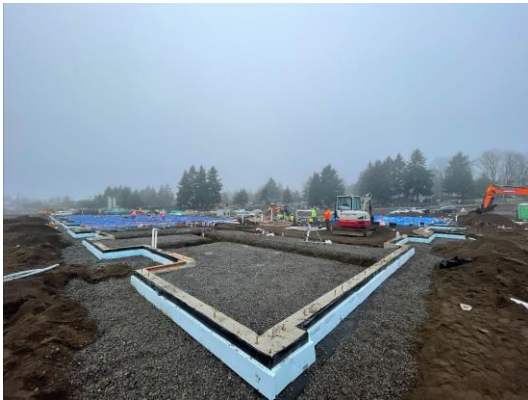
2/8/22 Building 1 - view from south corner of Building 1, looking north.