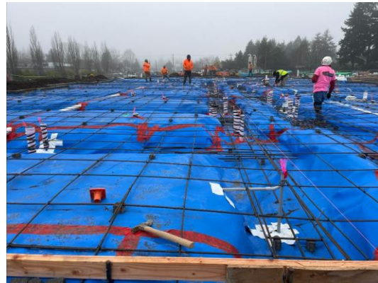
2/8/22 Building 1, looking northwest.