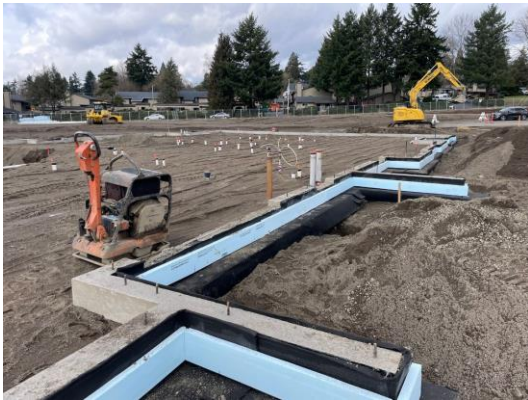
2/1/22 Building 1 exterior foundation on Parcel 1, looking north.