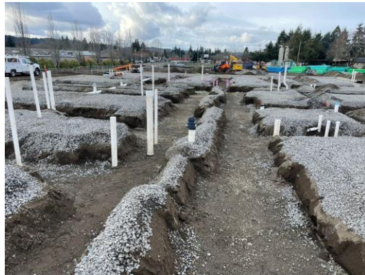
2/1/22 Building 1 interior foundation excavations on Parcel 1, looking west.