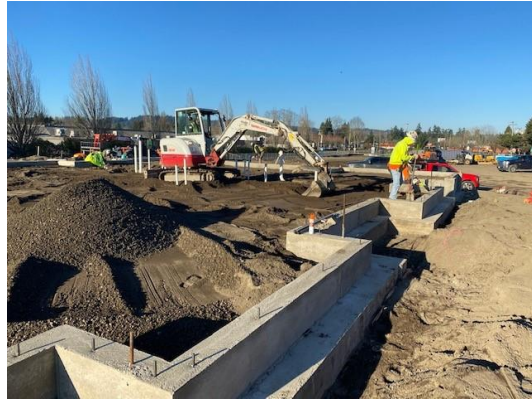
1/27/22 Backfilling underground plumbing at Building 1 on Parcel 1, looking north.