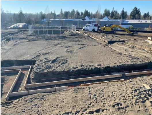
1/27/22 Clubhouse area on Parcel 2, looking south. Elevator pit in background, fenced off. Stockpiled excavated Parcel 2 soil in far background.