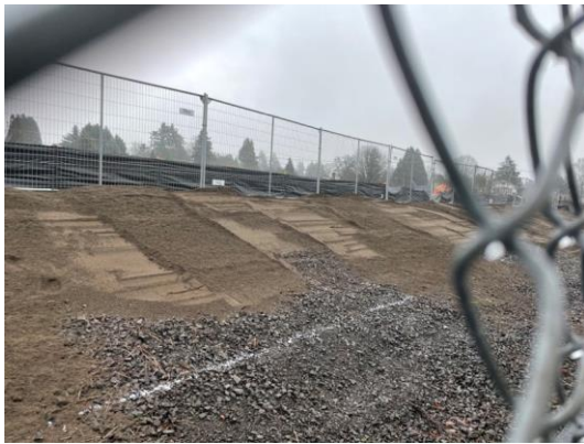
1/19/22 Erosion control measures along south of site, looking northeast.